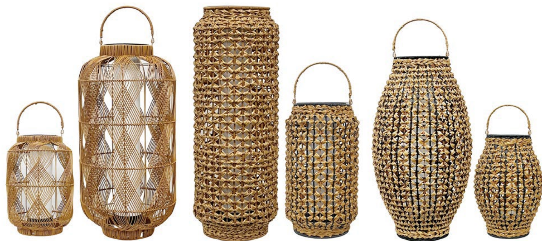
Outdoor Solar Lights

We can provide wholesale and manufacture of all types of products, such as outdoor solar lights, outdoor garden lights. All our products have passed the CE certification and ETL certification of EU countries. We also have ISO9001 certification. There are a variety of lamps in the exhibition hall to support customers to visit the factory.