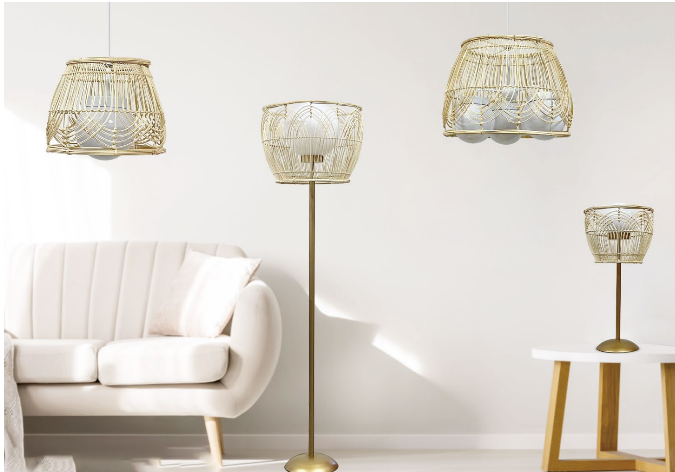
woven rattan lamp

As the best woven lamps wholesale manufacturer, XINSANXING has more than 15 years of professional experience in cooperating with customers to produce lamps manufacturing wholesale. The main products of woven lamps manufactured are woven pendant light, woven pendant light, woven Floor Lamp.