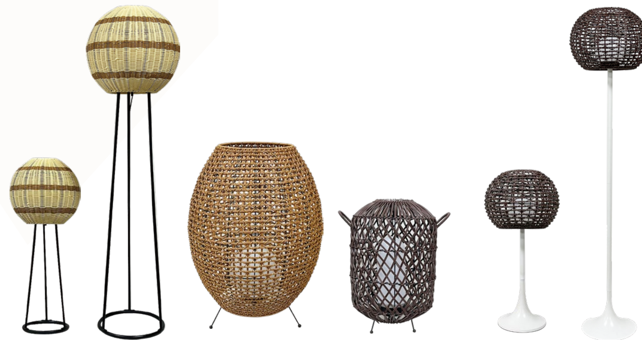
Outdoor garden lights

Our own production base makes the products have a price advantage. The products sell well in more than 30 countries including Germany, the United States, Brazil, Argentina, Canada, Spain, Italy, and Malaysia. Our OEM and ODM services can provide customized services for customers.